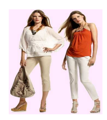
<u>2000 – present</u>

Most people in summer wore jaens and shirts with short-sleeves.